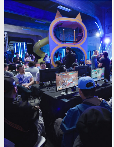
Gamers at NRG Spectrum Castle enjoy the benefits of high-speed connectivity, whether playing in global matches or just competing with friends.

NRG leverages this connectivity to field some of the most competitive and recognized esports teams in the country.