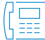
Voice and collaboration