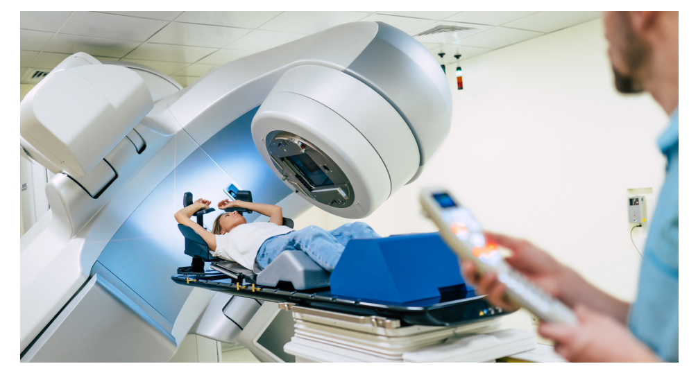
Many different types of medical imaging equipment utilize fiber circuits to facilitate actionable diagnoses from patient scans. Reliable, scalable Dedicated Fiber Internet (DFI) from Spectrum Business helps make this possible.

operations manager explains. "Images that need the most data get pushed through at night, while those that have been processed already require less data and can be sent to referring physicians immediately."